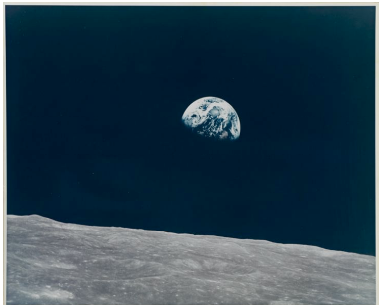
"Apollo 8 · Earth Rise", Dec. 24, 1968, glossy Kodak colour print, 40,8 x 50,5 cm

Sparse, abstract landscapes, colourful planets and daring maneuvers will be shown on spectacular, large-format NASA photographs.