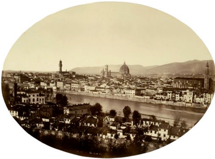
Fratelli Alinari, "Panorama dal Monte alle Croci, Firenze", 1852/55, lightly albumenised salt print from glass negative, 42 x 31 cm